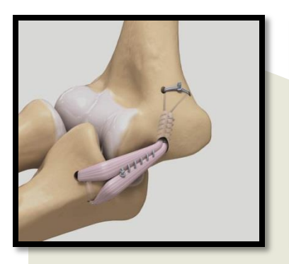
Figure 1: Tommy John Surgery with docking technique.